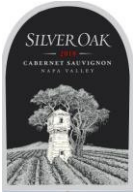
Silver Oak Cabernet Sauvignon 2019 | Napa Valley, United States